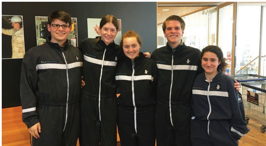
Students suit up for a tour of a salt mine in Berchtesgaden.