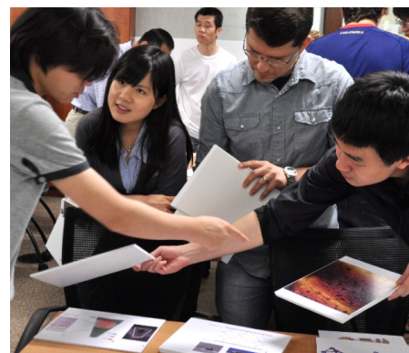
Participants work on images that illustrate their research.